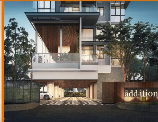
3 - Bedroom + Study